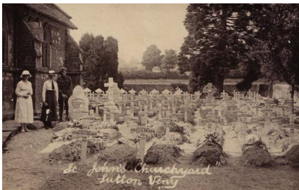
War Graves at Sutton Veny