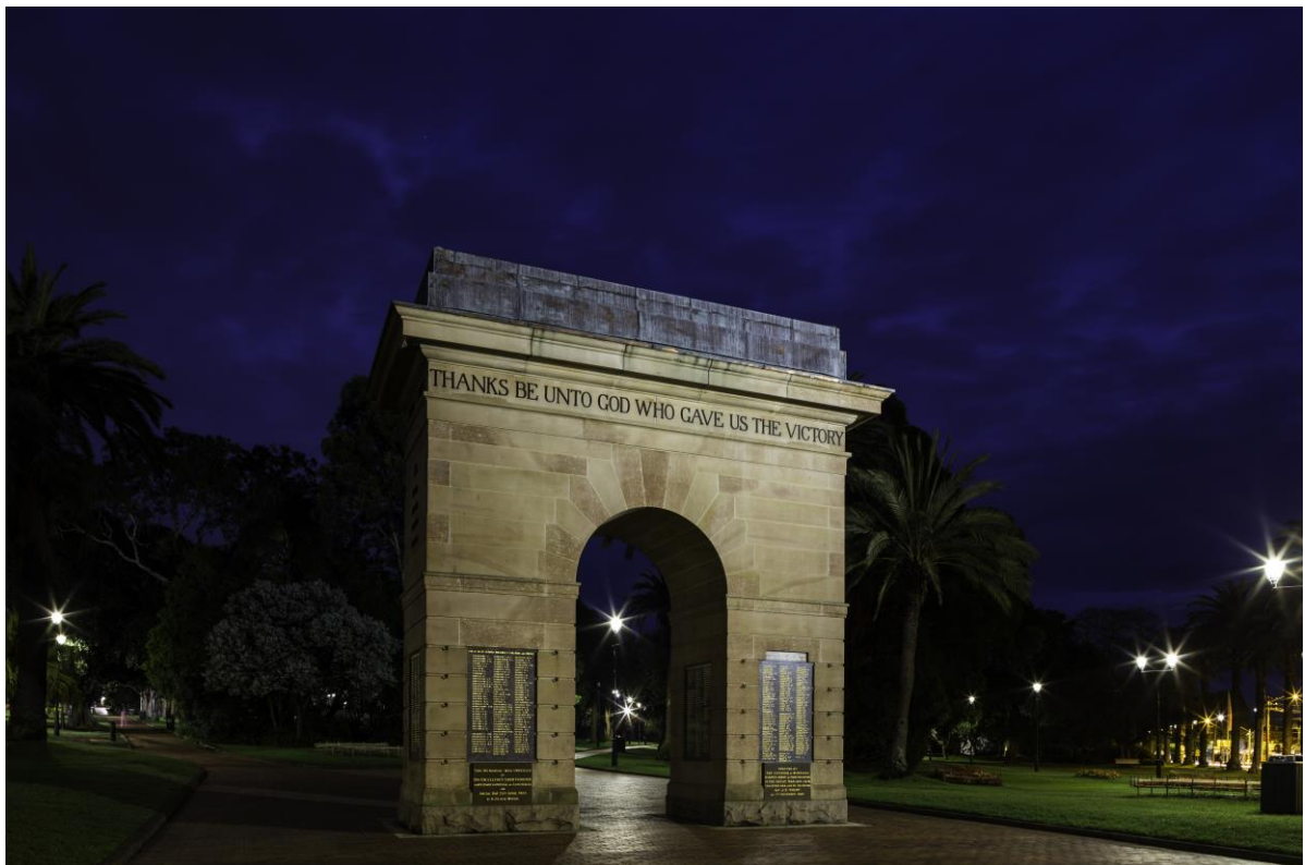
Burwood War Memorial Arch