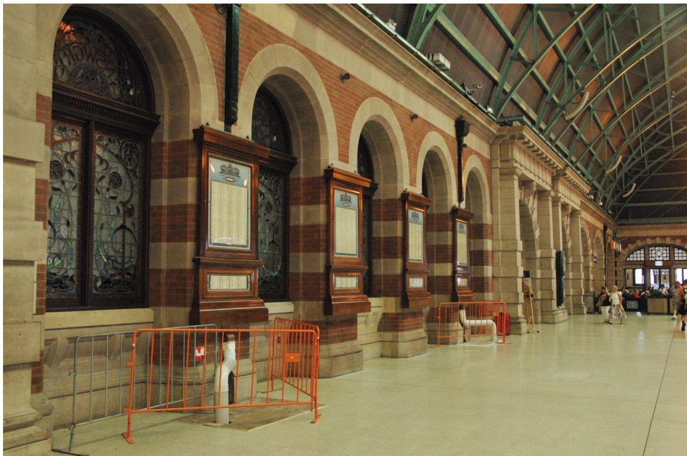
NSW Government Railways & Tramways Roll of Honour